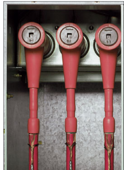
IXSU-F terminations installed with Raychem insulated connection system (RICS)

over several decades under severe environmental conditions. It delivers outstanding tracking and erosion resistance, mechanical strength, weatherability and dielectric properties.