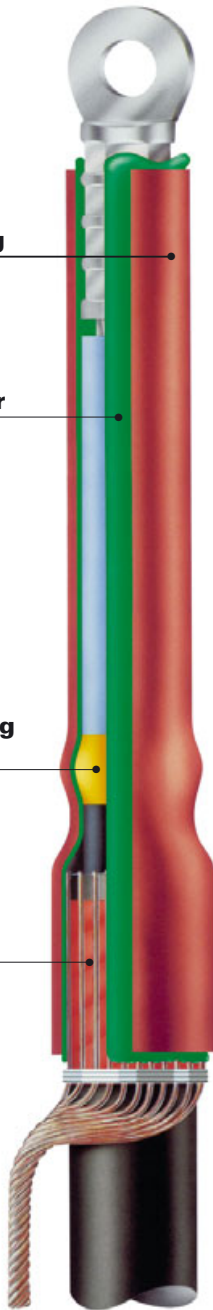
IXSU-F indoor termination