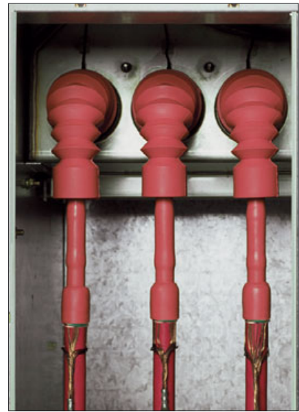
IXSU-F terminations installed with Raychem elastomeric bushing boot (RCAB)

The materials used in the IXSU-F/OXSU-F termination generation have undergone many years of development, yielding a polymeric material with exceptional electrical and weathering properties. The formulation is based on proven polymer compounds, exhibiting excellent stability and long-term performance