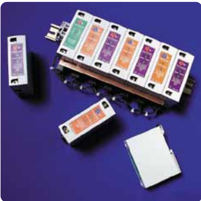
Silicon Avalanche Diode (SAD) and Metal Oxide Varistor (MOV) replaceable DIN rail mountable modules for MDSP3-90, 150 and 300 series

The MDSP should be installed as close as possible to the supply cables being protected, with as large a conductor as possible (35mm 2 max). The connecting wires should be routed, avoiding looping, and secured together with ties. See installation data sheet instructions. The Modular Distribution Surge Protector must be connected in parallel to supply via an isolating switch if the mains supply cannot be switched off for module replacement. If RCD's are used the MDSP must be fitted in front of such devices to avoid nuisance tripping. Provision should be made for safe replacement of the MDSP and/or modules should this become necessary.