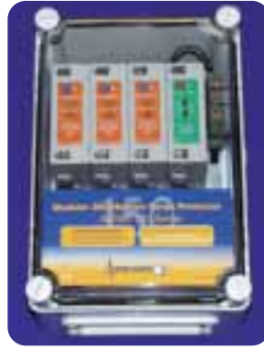
Pictured - MDSP3/150

This three phase DIN rail mounted modular surge protector comprises three 90kA Line/Neutral MOV modules and one 150kA Neutral/Earth MOV module all of which are housed in a high impact plastic enclosure with clear cover. All modules have dual thermal and current overload fusing and are so arranged as to provide a redundancy feature should one of the discs be damaged due to excessive energy. Status indication of the modules is by lights and the Neutral/Earth module provides indication of high neutral to earth voltages. All modules have a remote indication facility.