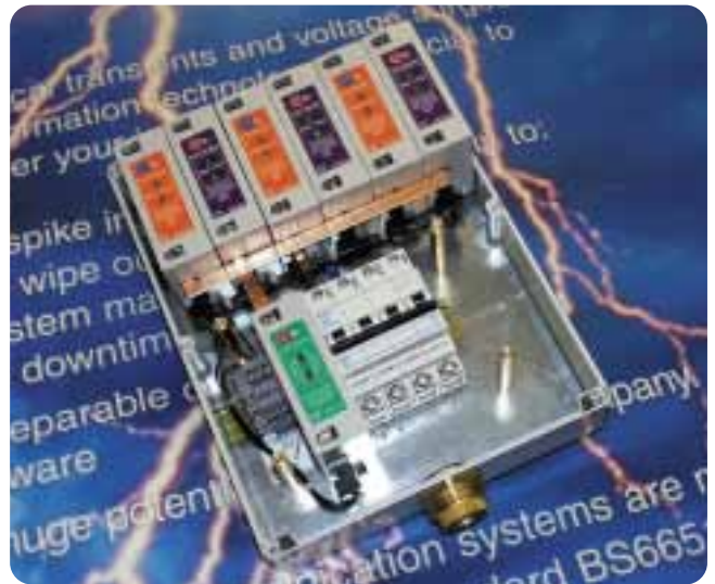
MDSP3/150/12-SAD/MOV model with optional MCB facility