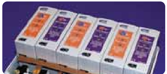
Full status is indicated on each suppression module

The MDSP can be connected to a supply greater than 100A providing inline fuses rated 100A max are fitted. In order to discriminate with the supply fuse the inline fuse should be in the ratio of 1:2. The inline fuses can be replaced by MCBs providing they are type C/D.