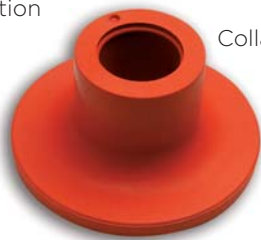
Collar for smaller bushing diameters