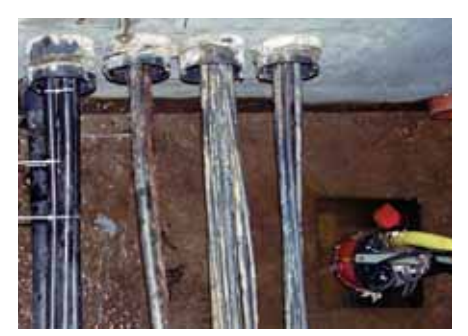
Eliminates the need to pump manholes dry, avoids ingress of mud into ducts, and withstands severely polluted environments.