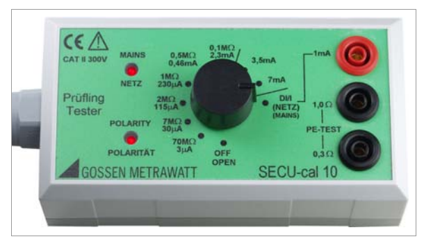
All limit values for the required tests per DIN VDE, as well as protective conductor resistance, insulation resistance, equivalent leakage current, differential and/or contact as well as housing leakage current must be tested.

DIN VDE 0701-0702 and IEC 62353 (VDE 0751-1). As a rule, these instruments must be tested once each year, as set forth by accident prevention regulation BGV A3 (previously VBG 4) as well as for certification in accordance with the ISO 9000 quality standard.