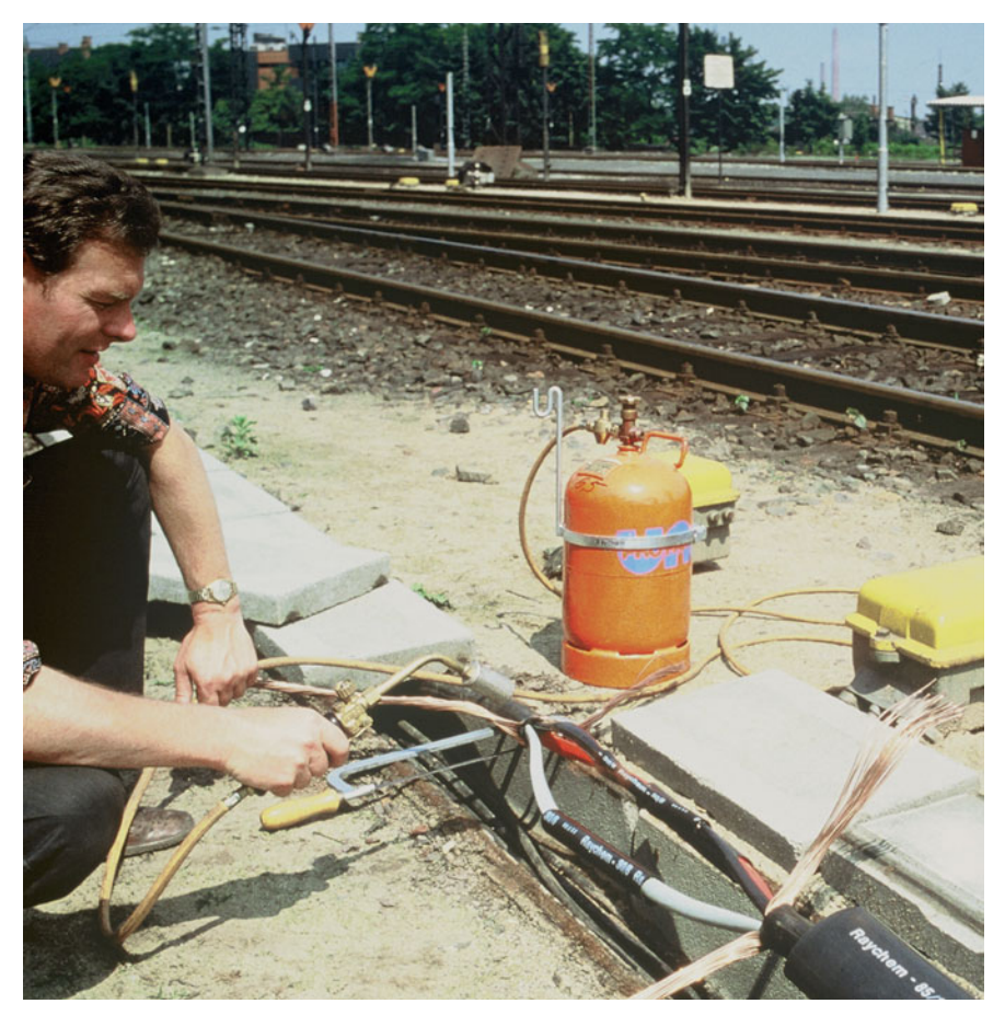
After the conductors have been jointed, the connectors are insulated and moisture sealed out by shrinking Raychem tubing over them. The specialpurpose adhesives are supplied already coated on the insides of the inner and outer joint components.

Cover photo: The heat-shrinkable outer sleeve, being installed with a gas torch by this German cable fitter, seals and mechanically protects this Raychem joint for a concentric neutral cable.