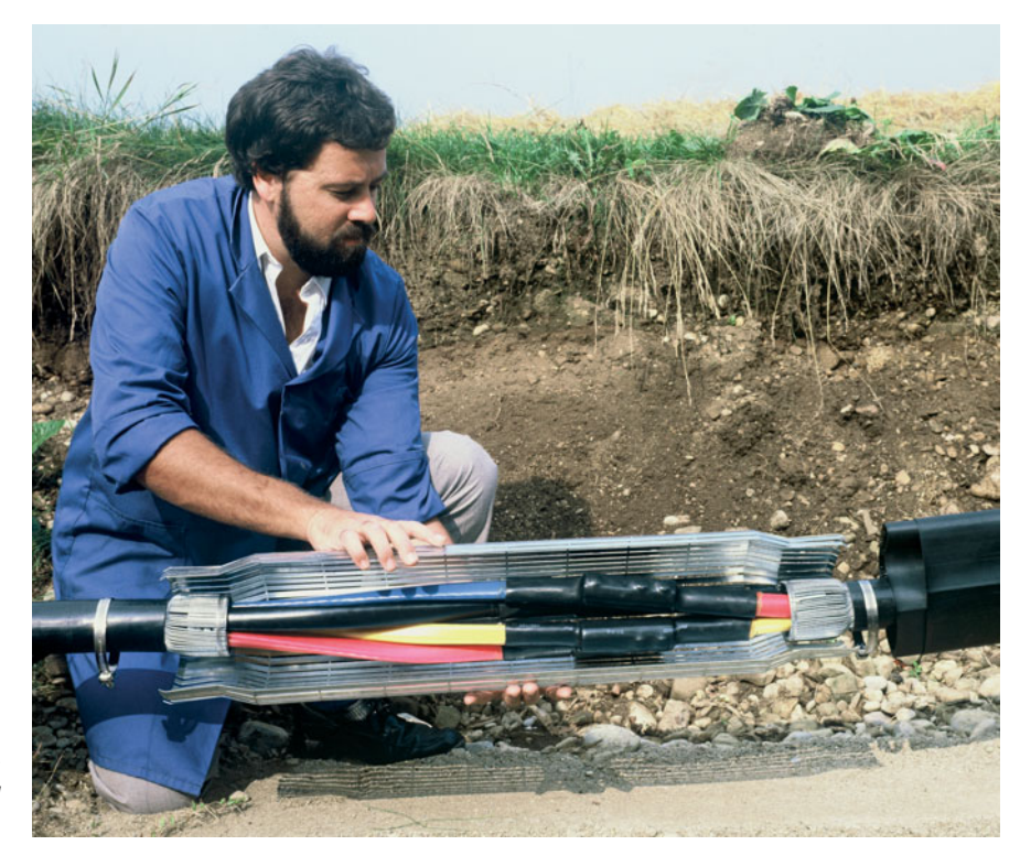
The Armarap joint case allows the electrical and mechanical functions of the cable armour to be restored simply and quickly.

Applying equally well to both armoured and unarmoured cables, the Raychem technique achieves insulating and sealing in one step by heating. This causes tubing, slipped over the cores before jointing, to shrink to tightly fit the connectors and insulation. At the same time the heat causes adhesive, supplied already pre-coated on the inside of the tubing, to melt and flow. The high integrity bond thus formed seals out moisture and corrosion, follows the thermal expansion of the cable, and can be reliably made on a range of core sizes and connector types without special skills or procedures.