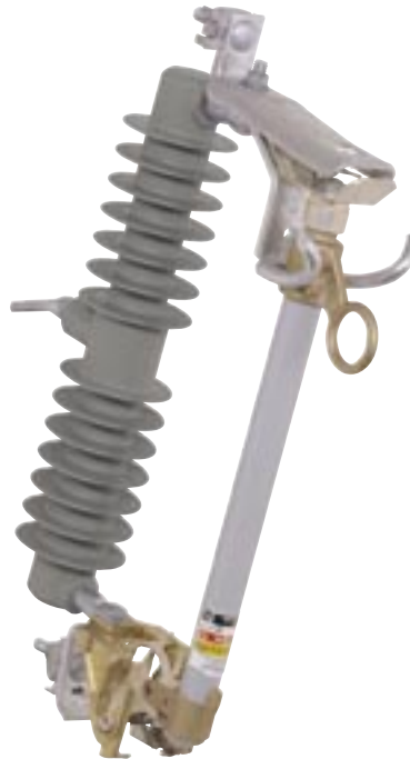
Catalog Number 89052R10-P-D▲ Ultra-Heavy-Duty Overhead—Pole-Top Style, rated 25 kV▼ nominal, 27 kV maxi- um, 150 kV BIL, 100 amperes con- tinuous, 12,000 amperes interrupting RMS asymmetrical (16,000 amperes single-shot), 17 inches (432 mm) mini- um leakage distance to ground.◆