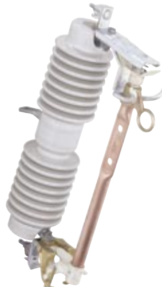
Catalog Number 89253R10-D▲ Disconnect, Overhead—Pole-Top Style, rated 25 kV nominal, 27 kV maximum, 150 kV BIL, 300 amperes continuous, 26 inches (660 mm) minimum leakage distance to ground.