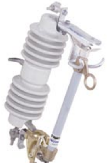
Catalog Number 89042R10-D▲ Extra-Heavy-Duty Overhead—Pole-Top Style, rated 25 kV nominal, 27 kV maximum, 150 kV BIL, 100 amperes continuous, 8,000 amperes interrupting RMS asymmetrical, 17 inches (432 mm) minimum leakage distance to ground.◆