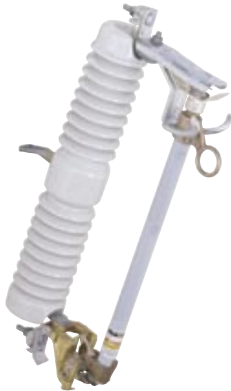
Catalog Number 89033R10-D▲ Ultra-Heavy-Duty Overhead—Pole-Top Style, rated 25 kV nominal, 27 kV maximum, 150 kV BIL, 100 amperes continuous, 12,000 amperes interrupting RMS asymmetrical, 17 inches (432 mm) minimum leakage distance to ground.■