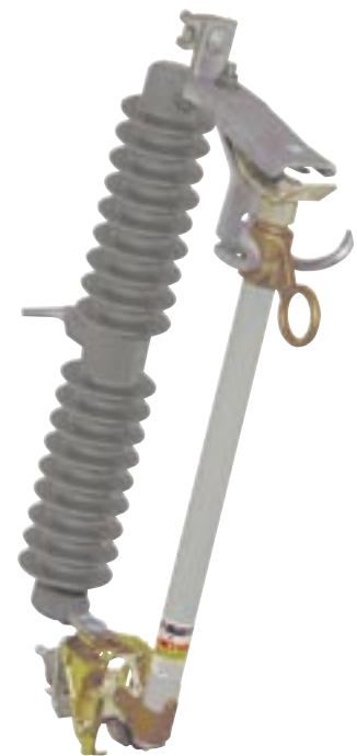
Catalog Number 89053R10-P-D▲ Ultra-Heavy-Duty Overhead—Pole-Top Style, rated 25 kV● nominal, 27 kV maximum, 150 kV BIL, 100 amperes continuous, 12,000 amperes inter- rupting RMS asymmetrical, 30 inches (762 mm) minimum leakage distance to ground.■

▲ Catalog Number Suffix “-D” provides for the inclusion of parallel-groove connectors each accommodating No. 6 solid (13.3 mm 2 ) through No. 2 stranded (44.4 mm 2 ) copper or aluminum in one groove; No. 2 solid (33.6 mm 2 ) through 250 kc mil (168 mm 2 ) stranded copper or aluminum, or 4/0 ACSR (161 mm 2 ) in the other groove. Catalog Number Suffix “-M” (not shown) provides for the inclusion of eyebolt connectors each accommodating one conductor ranging in size from No. 8 solid (8.4 mm 2 ) through 250 kc mil (168 mm 2 ) stranded copper or aluminum, or 4/0 ACSR (161 mm 2 ).