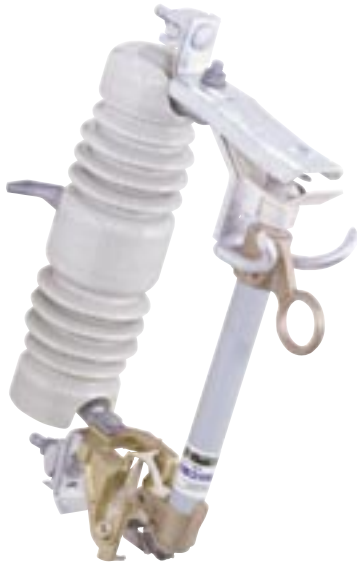
Catalog Number 89021R10-D▲ Extra-Heavy-Duty Overhead—Pole-Top Style, rated 14.4 kV nominal, 15 kV maximum, 110 kV BIL, 100 amperes continuous, 10,000 amperes interrupting RMS asymmetrical, 8½ inches (216 mm) minimum leakage distance to ground.