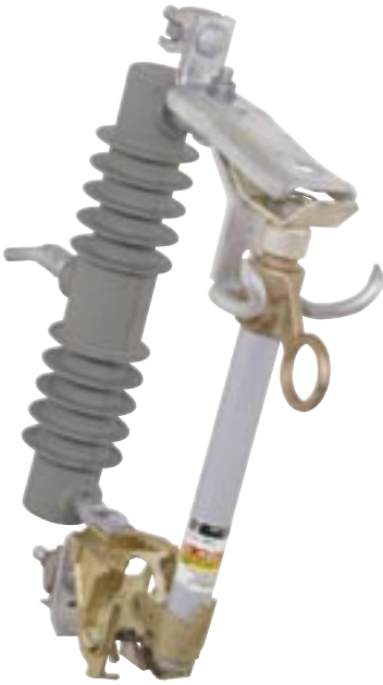
Catalog Number 89031R10-P-D▲ Ultra-Heavy-Duty Overhead—Pole-Top Style, rated 14.4 kV nominal, 15 kV maximum, 110 kV BIL, 100 amperes continuous, 16,000 amperes inter- rupting RMS asymmetrical, 8½ inches (216 mm) minimum leakage distance to ground.