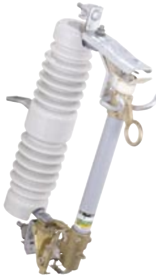
Catalog Number 89072R11-D▲ Ultra-Heavy-Duty Overhead—Pole-Top Style, rated 25 kV nominal, 27 kV maximum, 125 kV BIL, 200 amperes continuous, 10,000 amperes interrupting RMS asymmetrical, 11 inches (279 mm) minimum leakage distance to ground.